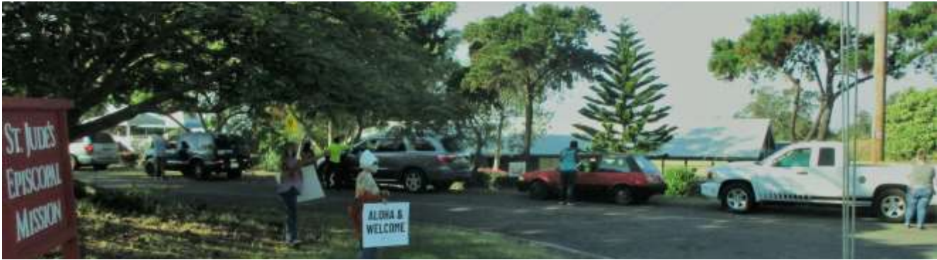
The Festival of Hope was a drive by event, and well attended by the community.