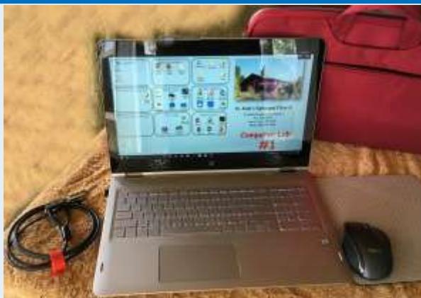
Computer Lab Station: 15.6inch Hp ENVY x 360 Notebook Computer, Padded Carrying Case, Mouse, Mouse Pad, and Kensington Security Cable

Computer Lab: We received a grant to create a computer lab at St. Jude's. The lab will serve several purposes. (1) It will provide access to computers, printers, and the internet to the school students. The high school bus drops the students off by our lower parking lot. The students who have computers come to St. Jude's to use our free Wi-Fi to do their homework, but many students don't have the necessary equipment or skills. (2) Pro-